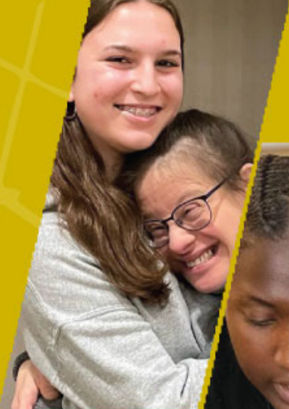
INTEGRATE FOR GOOD