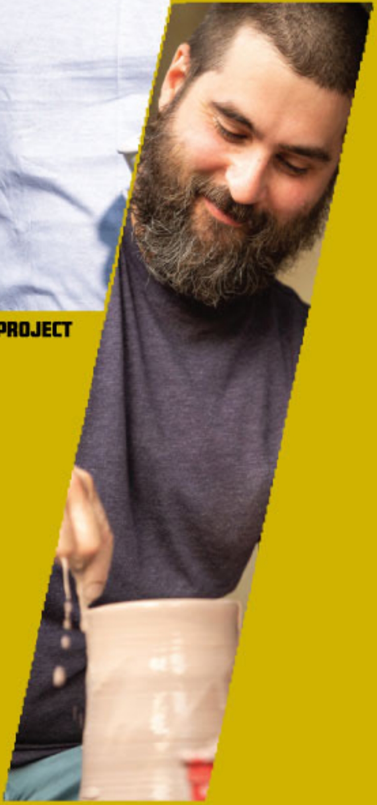
THE CLAY STUDIO