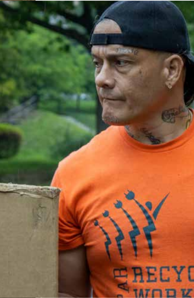
L to R: BEYOND THE BARS | PAR RECYCLEWORKS