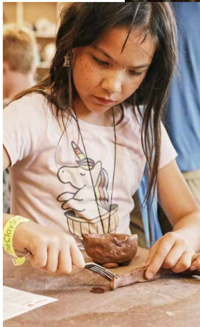
THE CLAY STUDIO