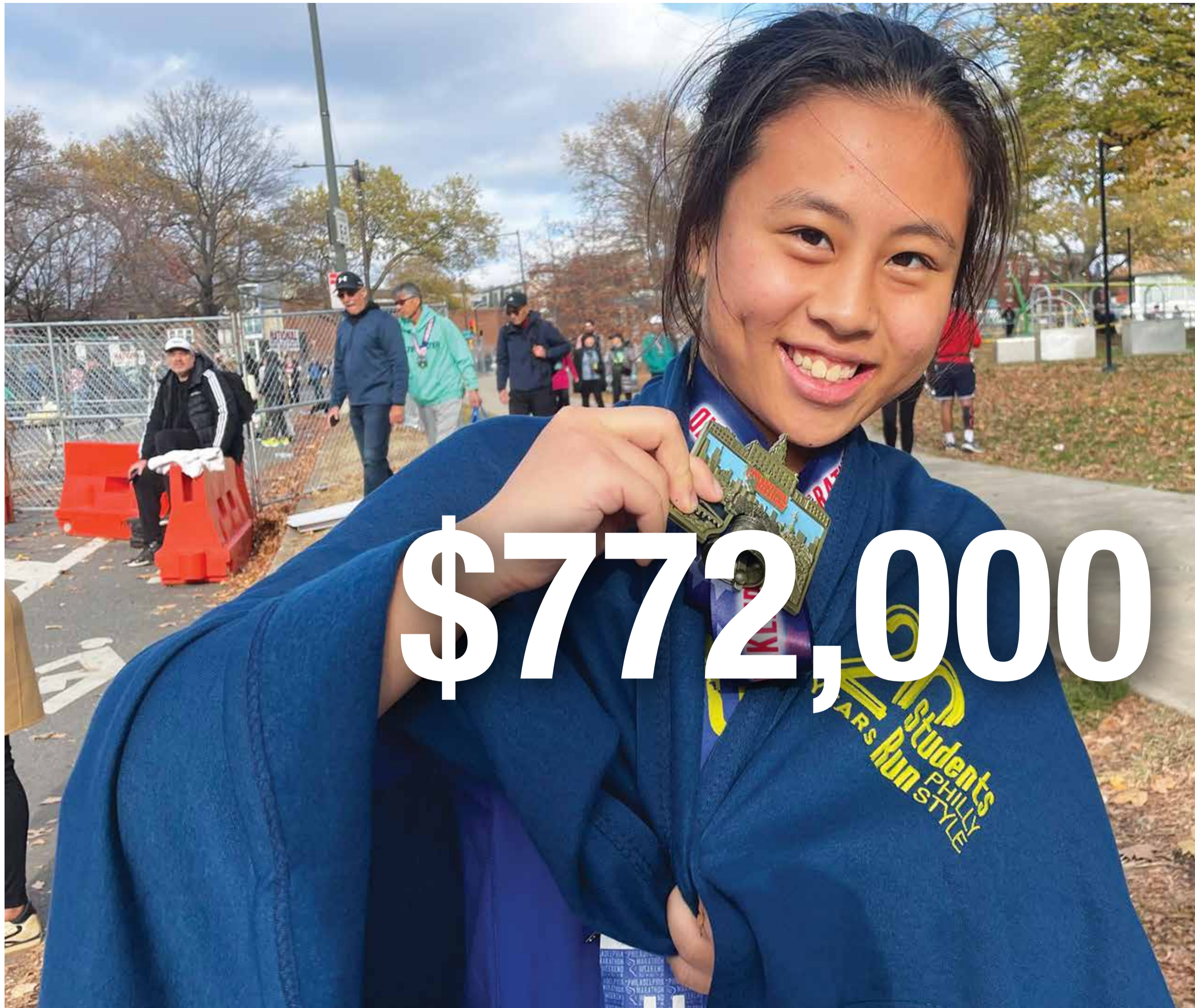
STUDENTS RUN PHILLY STYLE